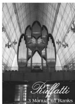
Fratelli Ruffatti Pipe Organs Padua, Italy

New 4 Manual Console to be interfaced with 45 Rank Casavant Pipe Organ at Sligo Seventh Day Adventist Church Takoma Park, Maryland